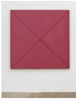
Aaron Sandnes Death Marks the Spot (1964 Pontiac) , 2016 Automotive paint on wood panel 60 x 60 x 1 3/4 inches