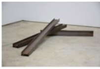
Kaz Oshiro Three Steel Beams , 2016 Acrylic on Canvas 10 1/2 x 96 x 48 1/2 inches