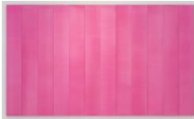
Roy Thurston 2016-1 , 2016 pink silicone on aluminum panel 72 x 120 x 1 1/2 inches